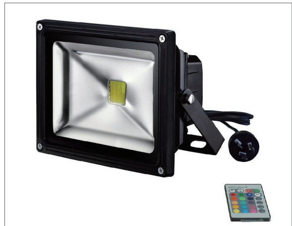
▲ CLA323630R Memory mode (Will restart on selected colour - except when switched off at wall)