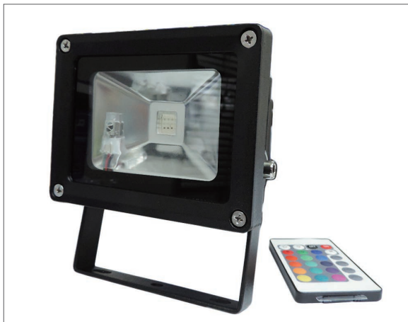
▲ CLA323610R Memory mode (Will restart on selected colour - except when using fade)